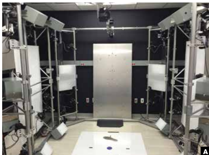
FIGURE 3. A) Three-dimensional total body photography apparatus (Canfield Scientific Inc, Fairfield, NJ). B) Representative 3D total body photography avatar with touchscreen interface allowing for enhanced viewing and demarcation of suspicious lesions. C) Avatar can be rotated 360 degrees to view all body surfaces.