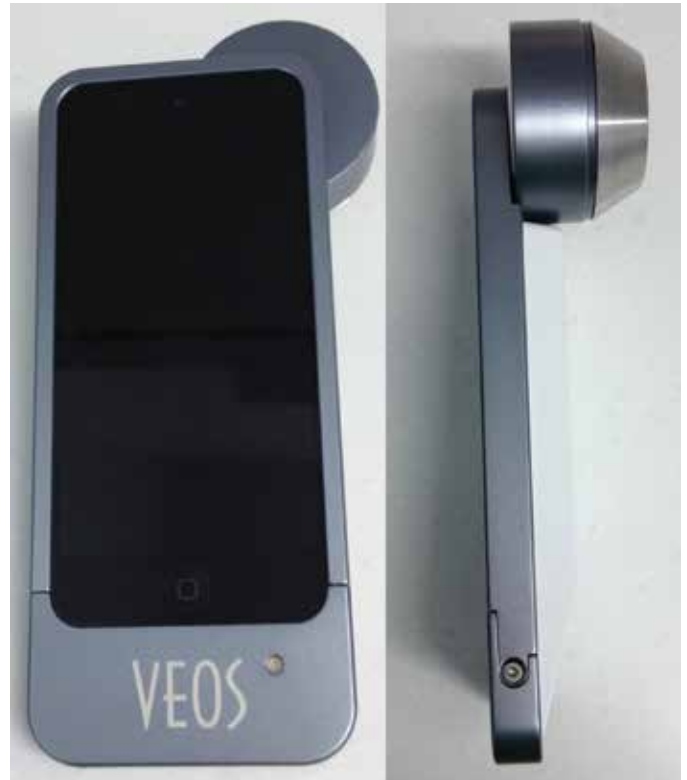
■ FIGURE 1. Mobile dermatoscope attachment allows for simultaneous dermoscopic evaluation and image capture (Canfield Scientific Inc, Fairfield, NJ).

cal features. It is also used to delineate surgical margins and to monitor patient's response to non-surgical therapies. 22-24 RCM has been utilized to evaluate tumors in sensitive areas, such as the eyelid, 25 and oral and genital mucosa. 26 Algorithms are developed to aid detection of skin cancer with RCM, which has achieved high