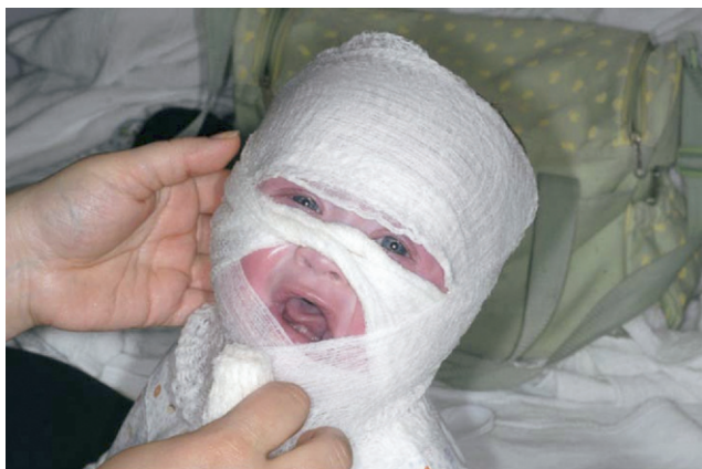
Figure 4 Wet wrap therapy of the face of an infant with severe facial eczema.

Wraps may be removed when they dry out (typically after 1-2 hours), or they may be re-wet. However, it is often prac-