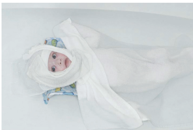
Figure 3 Bathing of child with AD with head involvement.

Patients frequently do not understand how the various vehicles of skin care products such as ointments, creams, lotions, and oils can affect treatment outcomes. In general, ointments seal the best and can be the most hydrating when used after bathing and they are formulated with the fewest