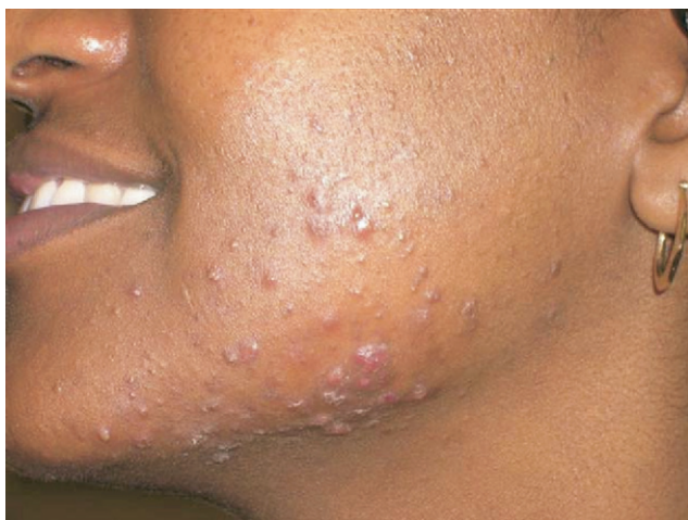
Figure. 3 Typical adult female acne.